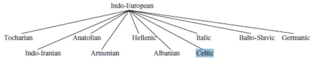
Figure 2.1 The Indo-European Languages (Hogg, Denison, 2006; p. 5)

which only became evident in the morphology and syntax of written English after the Old English period (Hogg, Denison, 2006). Scottish Gaelic, which belongs to a Celtic branch, is still spoken in Scottish Highlands.