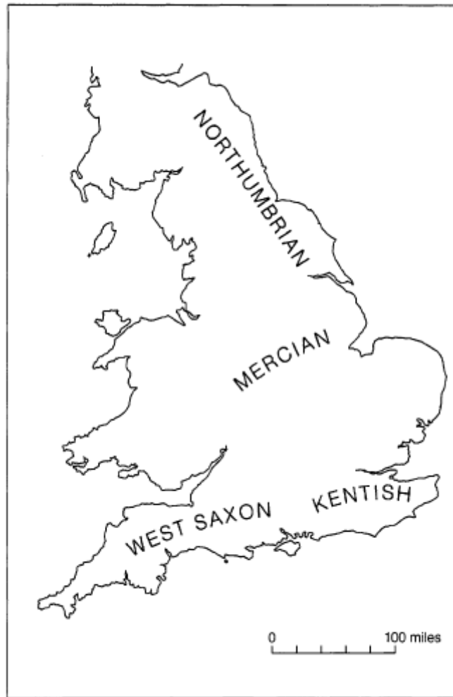
Figure 2.2 Old English dialects (Knowels, 1997; p. 35)