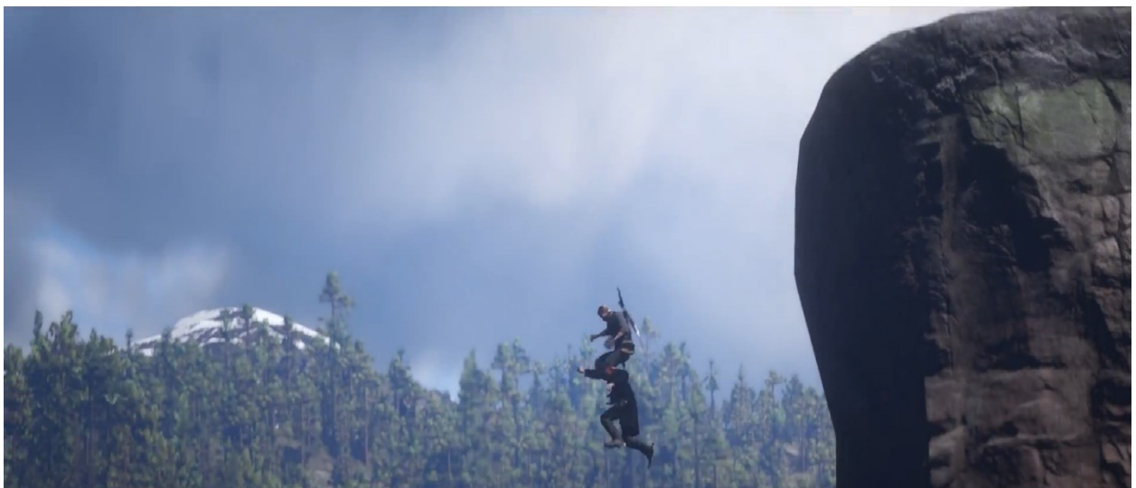
Fig. 4. Still of Dutch Van der Linde and Arthur Morgan jumping off the cliff from the video game Red Dead Redemption 2 , 2018.

Another interesting visual homage is found to be in honor of Django Unchained (2012). The scene when Calvin J. Candie's mourners are returning to their home is almost identical to the one when the Dutch Van der Line gang is walking towards the Braithwaite mansion to look for