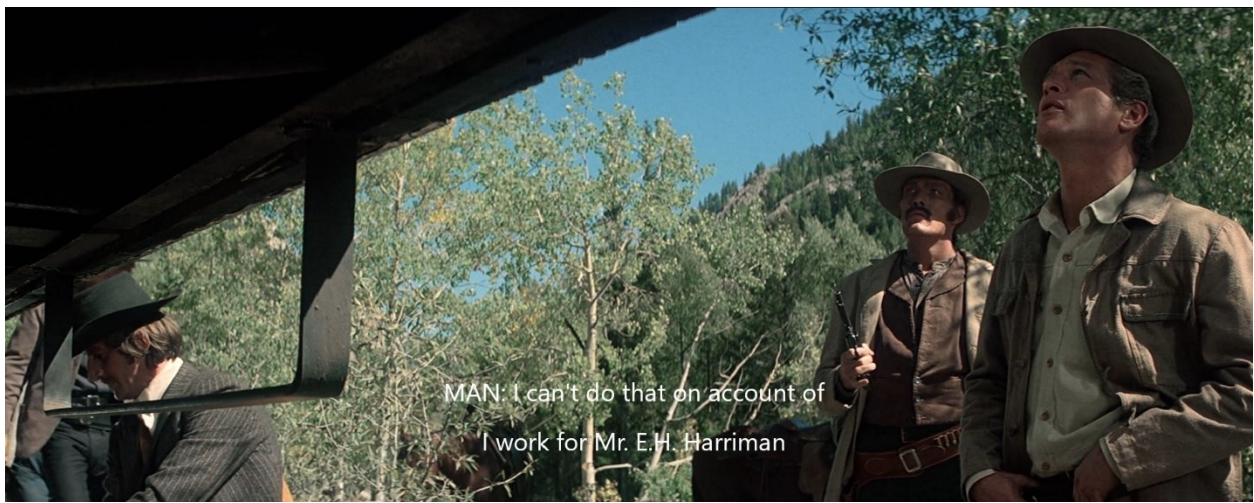
Fig. 1. Still of the Wild Bunch gang robbing the train from the film Butch Cassidy and the Sundance Kid , 1969.

The first homage is an already mentioned one. When Butch Cassidy and his gang rob a train, they rob E. H. Harriman’s Union Pacific Train which ends up haunting them for the duration of the film ( Butch Cassidy and the Sundance Kid ). When Dutch Van der Linde and his gang decide to rob a train, they also find out that it is Leviticus Cornwall’s train they are robbing for bonds ( Red Dead Redemption 2 ). In both scenes, a man who works for Harriman and Cornwall explains their job to the leaders of the gangs.