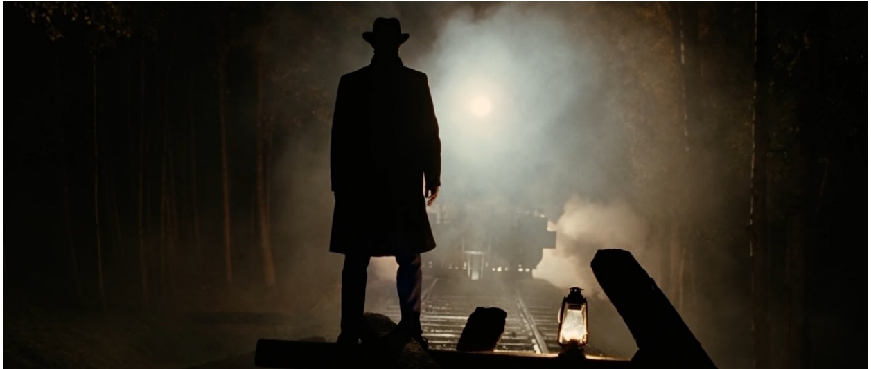
Fig. 7. Still of Jesse James standing on a barricade from the film The Assassination of Jesse James by the Coward Robert Ford , 2007.