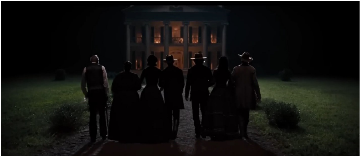
Fig. 5. Still of Calvin J. Candies' mourners walking towards his mansion from the film Django Unchained , 2012.

Jack. The look of the mansion, the path to it, and the characters walking up to the respective houses are visually very similar. What is not the same is the situation and the characters whose moral polarity from the audience's perspective is reversed—in Django Unchained the characters walking up to the house are the villains' family, and the members of the Van der Linde gang walking up to the Braithwaite mansion in Red Dead Redemption 2 are the protagonists of the game, doing what is necessary from the player's perspective.