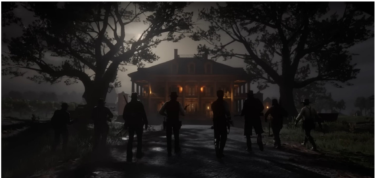
Fig. 6. Still of the Van der Linde gang approaching the Braithwaite manor from the video game Red Dead Redemption 2 , 2018.