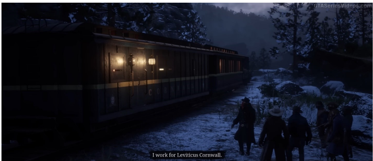
Fig. 2. Still of the Van der Linde gang robbing the train from the video game Red Dead Redemption 2 , 2018.