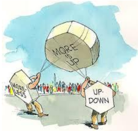
Figure 2: MORE IS UP metaphor

substance rise (as opposed to LESS IS DOWN) (ibid.). Some concrete examples would be: the number of soldiers rose and the number of sandwiches sold went up .