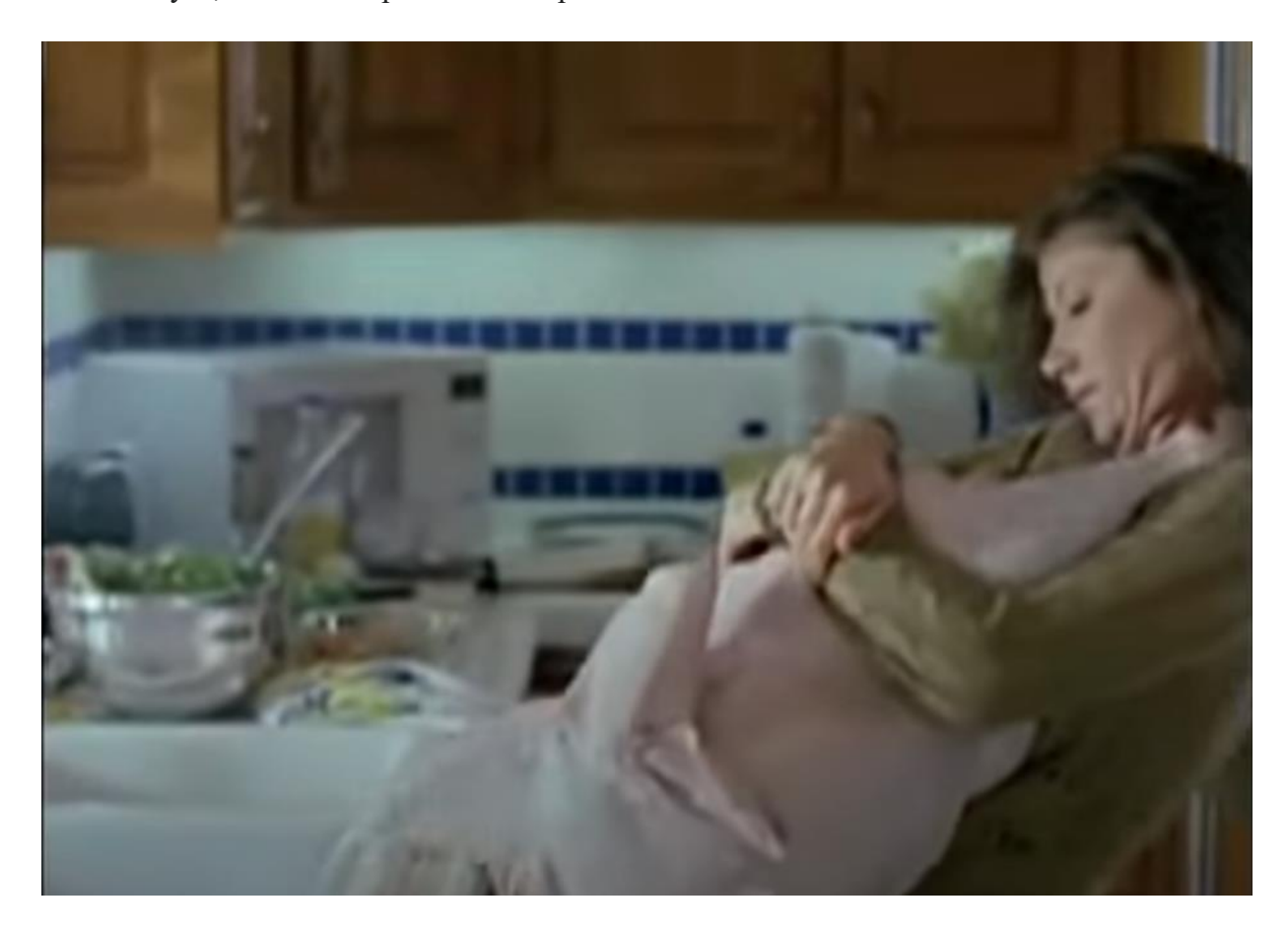
Image 14: Jennie-O Oven Ready Turkey commercial – struggling with the turkey

The viewers see a woman preparing a dish in the household's kitchen. When she finishes chopping up the vegetables and washing her hands, she goes over to the turkey that has just been washed. Seeing as the turkey is still wet, the woman is unable to get a proper grip on it, and while trying to wrestle it out of the sink, the turkey finds itself on the floor. The woman releases a sigh and goes to pick up the turkey off the floor. When she picks it up, she tries to forcefully lift the turkey up to the sink and the turkey goes flying out of the window, hitting a man watering the lawn on the head. The commercial then cuts to a slogan of the product "Tired of wrestling with turkey?", as well as a picture of the product.