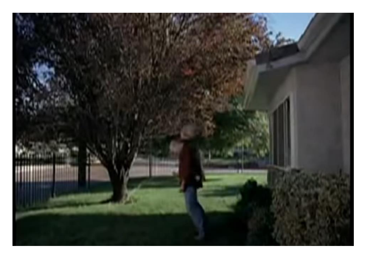
Image 15: Jennie-O Oven Ready Turkey commercial – man getting hit by the turkey

As far as credibility is concerned, this commercial does not truly feature any gender as either user or authority. The main female character featured in the commercial is struggling (using) with a real, uncooked turkey. The commercial instead "recommends" that instead of hassling with an uncooked turkey, the audience should use (assume the user role) the premade, ready to cook turkey the commercial advertises. This is quite an unusual occurrence, as food commercials tend to put an emphasis on the actors eating and enjoying the product that is advertised to entice the viewers to also want to consume the product. Both the female and male characters are middle aged, around their 40s.