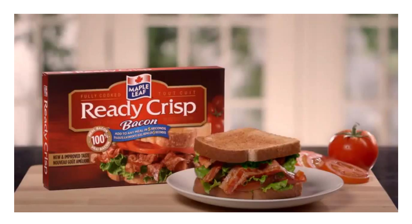
Image 17: Maple Leaf Ready Crisp Bacon commercial – packaging and product

Regarding the credibility , the commercial features the female gender in the user role. The mother is shown in multiple different circumstances using (preparing) the product for the family to eat. The male gender is shown in both the user and authoritative role. Although not shown explicitly, the father and two sons use and enjoy (consume) the product, hence the sudden change in behavior. The narrator (authoritative figure) that utters company's slogan ("Change your life with Bacon") is also male. The grown male and female characters are middle aged , around their 40s. The children would fit into the young category, both being around 7-8 years old.