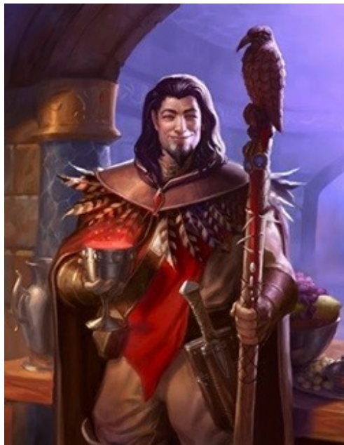
Figure 1. Young Medivh

Medivh, as described in the original trilogy, is reimagined during his latter reappearance as a prophet spirit in the video game and the movie. However, Blizzard Entertainment and the rich Warcraft community have released some visualizers that best