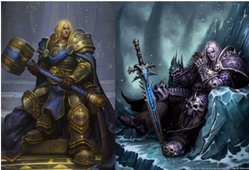
Figure 6. Arthas - before and after becoming the Lich King

Arthas Menethil is depicted with golden hair and strong hammer before he becomes the Lich King. He is in a gold armor, a shining prince, a savior. His appearance drastically changes as he takes on the curse of the sword Frostmourne and becomes the Lich King. The sword becomes his main weapon as he is often portrayed on his throne. His armor is now donned with skulls and spikes while his hair is white. A promising look of a young warrior is replaced by menacing, glowing eyes of the king of the Undead.