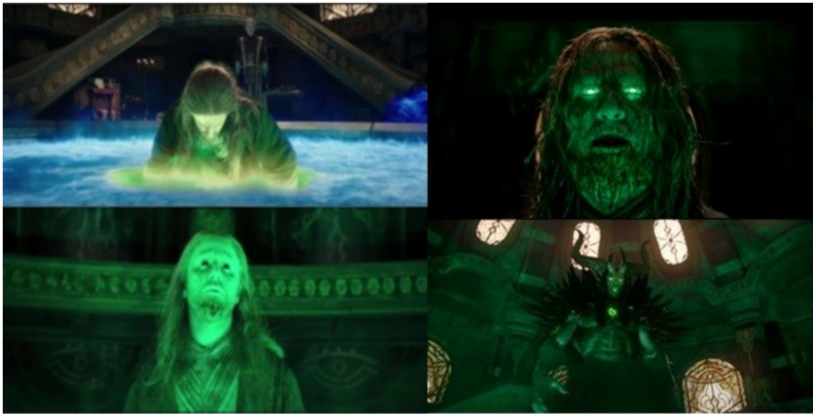
Figure 3. The corruption stages of Medivh Warcraft . Directed by Duncan Jones. Universal Pictures, 2016. Netflix , 01:16:05-01:17:10 and 01:29:11-01:38:15.

The particularly impactful visualization of Sargeras overtaking Medivh's body and soul actually occurs in the movie Warcraft (2016) where Medivh becomes completely disfigured by this demonic force simultaneously turning the mana pool green, which is the color of Hell and evil. In a later stage of transition, Medivh, or Sargeras, takes on the new demonic body of massive stature with horns. Horns are often used to symbolize great power, immortality, and aggressiveness as the real animal horns are used for fight and are extremely durable. Ancient Egyptians, as well as Carl Jung, identify horns with madness and rage ("Horns").