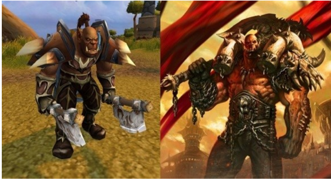
Figure 4. Young Garrosh (left) and Garrosh, the leader of the Horde (right)

https://static.wikia.nocookie.net/wowpedia/images/b/bf/Garrosh_Glowei_-_cropped.jpg/revision/latest?cb=20180914143616 and