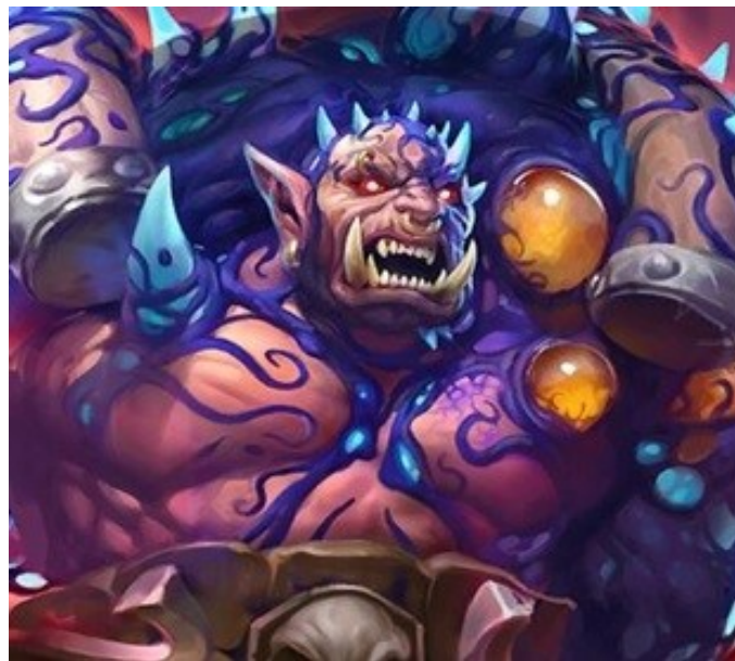
Figure 5. Garrosh Hellscream after the corruption

https://static.wikia.nocookie.net/wowpedia/images/f/f3/Garrosh_Hellscream.jpg/revision/latest?cb=20141220074321 .