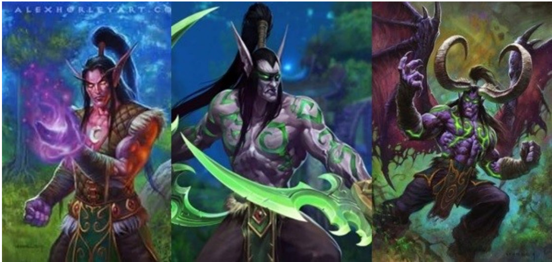
Figure 7. Illidan Stormrage and the three stages in his physical development

the first with the other two images in the Figure. 8, it is clear that the focus is put on the green color in Illidan's portrayal.