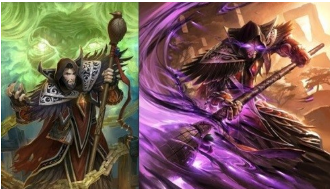
Figure 2. Corrupted Medivh