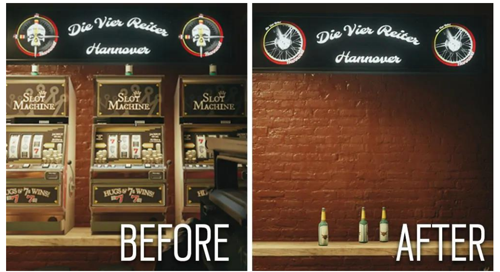
Figure 2 The removal of slot machines. © Tom Clancy's Rainbow Six Siege