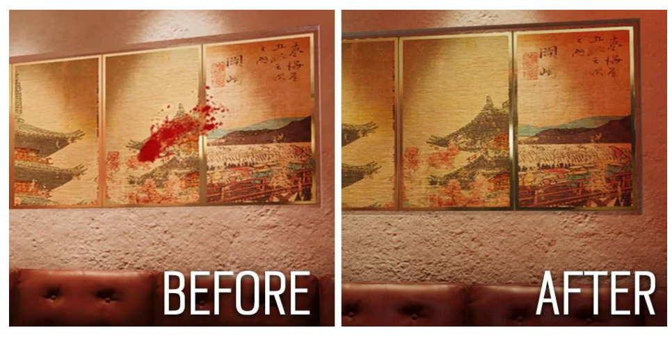
Figure 1 Blood being removed from the game. © Tom Clancy's Rainbow Six Siege

In its attempt to expand their influence on the Chinese market, the video game company Ubisoft had to make certain adjustments in their online-shooter Tom Clancy's Rainbow Six Siege . Everything depicting death, nudity, gambling, or violence had to be changed. This can be seen in the examples below.