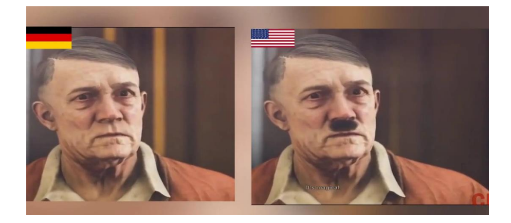
Figure 5 The German version has Hitler's moustache removed so it does not form a resemblance.