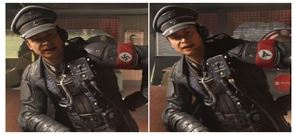
Figure 6 The Nazi swastika being swapped with a triangular shape. © Wolfenstein II: The New Colossus

Figure 5 The German version has Hitler's moustache removed so it does not form a resemblance. © Wolfenstein II: The New Colossus