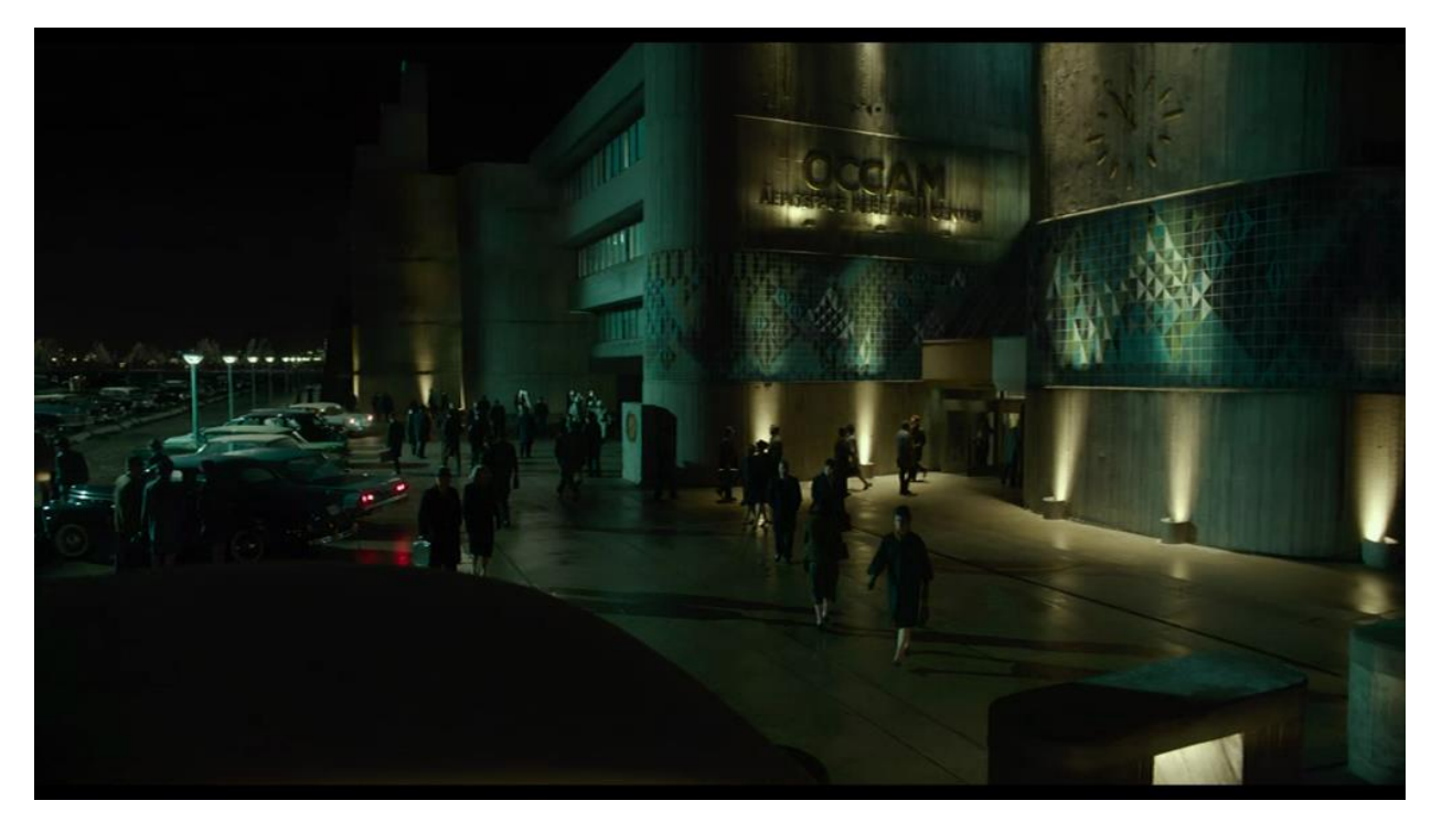
Fig. 5 A view of Occam Aerospace Research Center at night (The Shape of Water, 00:08:51)

Once Elisa's romantic relationship with the Asset fully develops, the previously dark palette is interspersed by red – the colour traditionally associated with love, passion, but also with danger. She buys a pair of red shoes, which she is previously shown merely admiring from afar, never daring to actually purchase them. After she had encountered the Asset and allowed both danger and passion into her life, she feels more empowered and plunges into the world on the "other side of the glass," choosing red both for the shoes and the clothes. Her relationship with the Amphibian Man allows her to really live the life she had merely fantasized about before, all of which is symbolized by the colour red (see fig. 6).