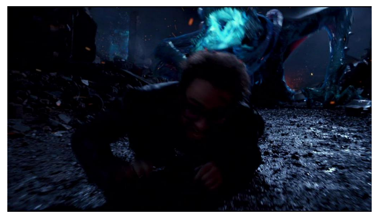
Fig. 3 Scientist Newton Geiszler crawling away from a new-born kaiju monster, one mirroring the other's movements ( Pacific Rim , 01:31:39).