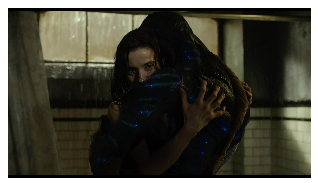
Fig 4 Elisa embracing the Amphibian Man/Asset (The Shape of Water, 01:29:20)

The film takes yet another praiseworthy step; it depicts Elisa's sexuality in a way that does not cater to the male gaze. Instead, the viewer is inconsequential, granted the privilege of being privy to Elisa's moments of solitude without those moments being tailored to the tastes of the assumed viewer. The scenes where she is alone in her apartment are an excellent example of this. She does not wear revealing clothing in those scenes, and neither are they shot from angles which would cater to any voyeuristic desires of the perceived audience. Her actions are for herself, and the viewer is instead granted insight into her world. The nude scenes humanize Elisa instead of objectifying her (see fig. 4).