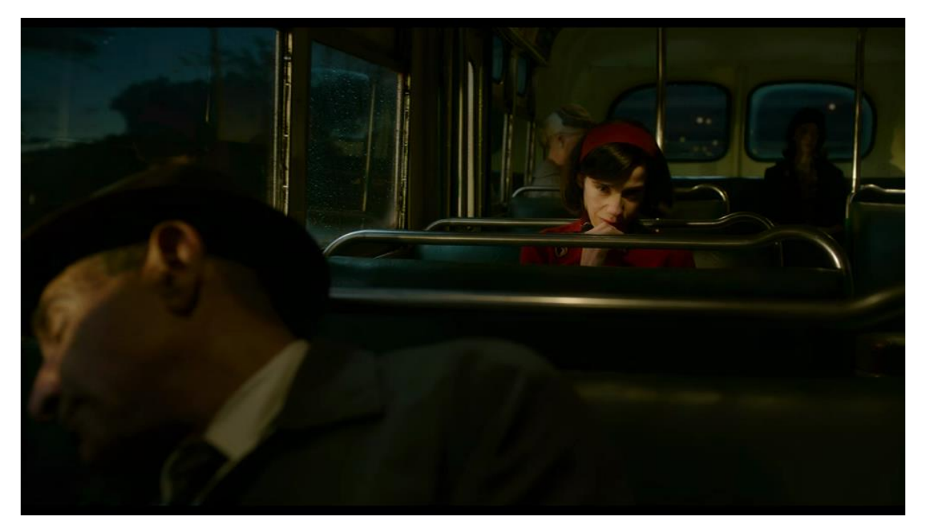
Fig. 6 Elisa on her way to work, wearing red after she had had a romantic encounter with the Asset ( The Shape of Water , 01:21:59)

Ultimately, the film is about seeing. It is about those who are "invisible" to the patriarchal, Western society, such as custodians, working people, disabled people, African American people, and others, who, despite of or because of their difference, are able to do something incredibly important. It is a film about solidarity, and also about recognizing "different" as human. In the end, the patriarchal, White, Western oppression rightfully crumbles with Strickland admitting to the Asset: "You are a god" ( The Shape of Water , 01:51:19 – 01:51:20). Not the god, but one of many, admitting the plurality of views, the multitude of identities, and the divine complexity of the "monstrous."