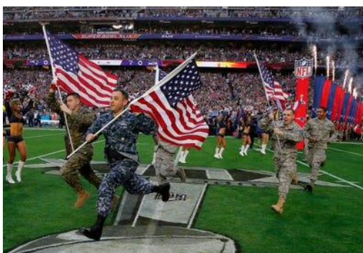
Fig. 2. Bertrand, Natasha. “The Pentagon Paid 14 NFL Teams $5.4 Million to 'Salute Troops'.” Business Insider , Business Insider, 12 May 2015, www.businessinsider.com/the-pentagon-pays-the-nfl-millions-to-honor-veterans-at-games-2015-5 . Accessed 30 September 2020)

Not only are the players compared to soldiers, but there is also proof that the core values of the American national identity include military, football, and patriotism.