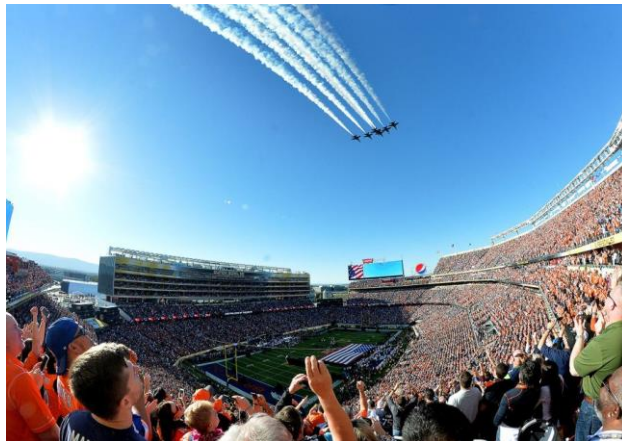
Fig. 2. “The Blue Angels perform a flyover during the singing of the national anthem before the start of Super Bowl 50 at Levi's Stadium in Santa Clara, California.” (Duran, Doug. February 7, 2016. Stars and Stripes ; www.stripes.com/air-force-super-bowl-flyover-features-combat-fighters-1.508475 . Accessed June 24, 2019.

in wars, none of which have anything to do with the actual playing of the game other than the symbolic portrayal of nationalism and the warrior ethic. (6)