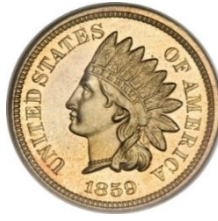
Fig. 1. Indian head cent (1859–1864 / 1864–1909). Numista . http://static-numista.com/catalogue/photos/etats-unis/g1280.jpg . Accessed 23 May 2015.

Advocating its design, the coin's creator, James Barton Longacre, directly related its indigenous accessory to American democratic ideals: