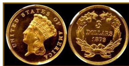
Fig. 2. Three-dollar gold coin (1854–1889). U.S. rare coin investments . http://www.usrarecoininvestments.com/coin_info/three_dollars.htm . Accessed 23 May 2015.