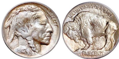
Fig. 8. Buffalo Nickel (1913–1938). USA coin book . http://www.usacoinbook.com/us-coins/buffalo-nickel-mound-type.jpg . Accessed 23 May 2015.