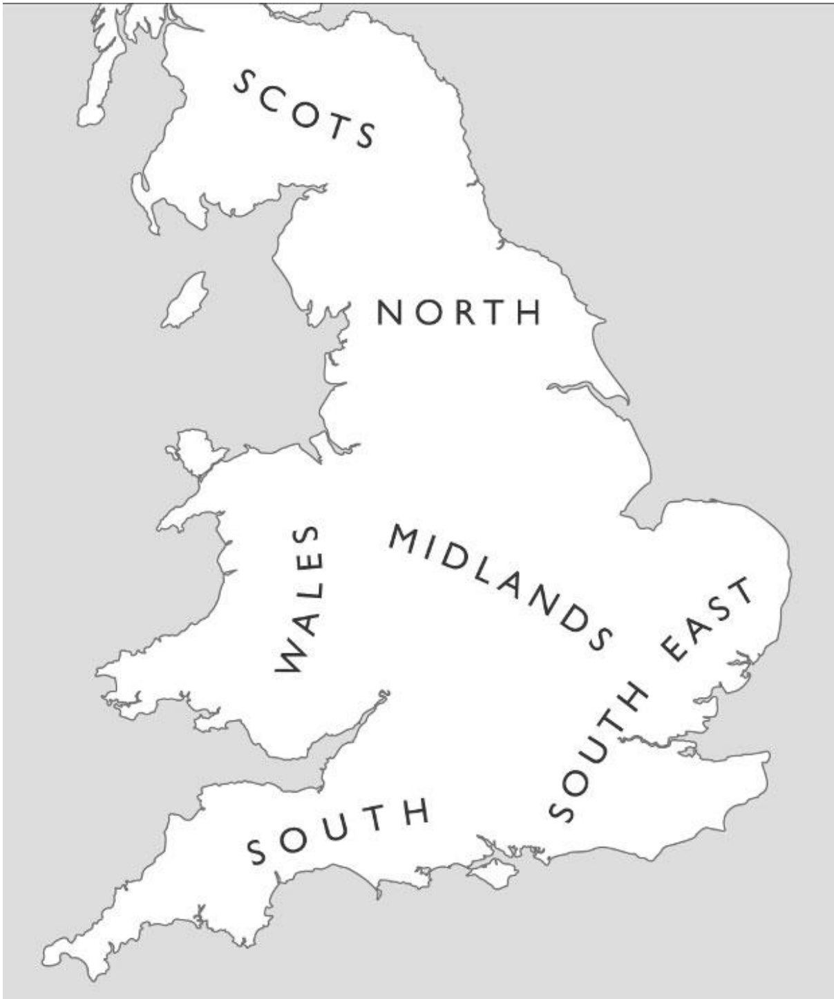
Map 3. Schematic map of the dialects of Middle English (After Horobin and Smith, 2002:60)