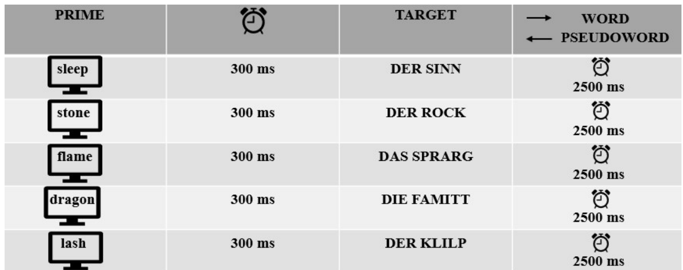
Figure 1. Experimental design.

word is an existing English word or not, again, by pressing the arrows on the keyboard. Words were appearing one by one. After the LexTale task in English, they saw the same task in German. In the LexTale tasks the participants were not time-restricted. Before the LexTale task in English they saw the instructions in English while before the task in German, there were instructions in German. The purpose of this task was to check their proficiency in English and German and to see while analyzing the results if it would be an important factor of recognizing whether a word is either a real word or a pseudoword. After the experiment, they had a questionnaire where they had to write down biographical and language data (age, gender, mother tongue, occupation, place they live in, etc.) and name the languages they learned and assess their level of proficiency in each of these languages. The questionnaire was based on Sabourin et al.'s (2016) language questionnaire.