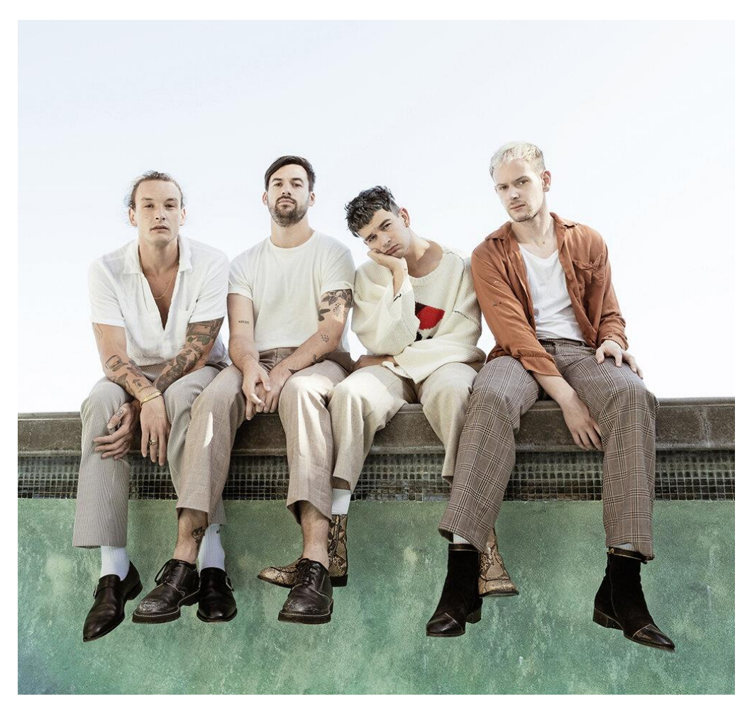
Picture 1. The 1975. From left: George Daniel, Ross MacDonald, Matty Healy, and Adam Hann.

As already mentioned, in order to understand the full range of metaphorical and metonymical creativity in poetry, one must require the context in which the poet creates. As the context heavily influences their choice of topic, therefore their usage of source and target domains in conceptual metaphors play an important role in Healy's songwriting. The following section deals with conceptual metaphor, explaining the main terminology while showcasing Healy's poetic creativity through examples of new conceptual metaphors.