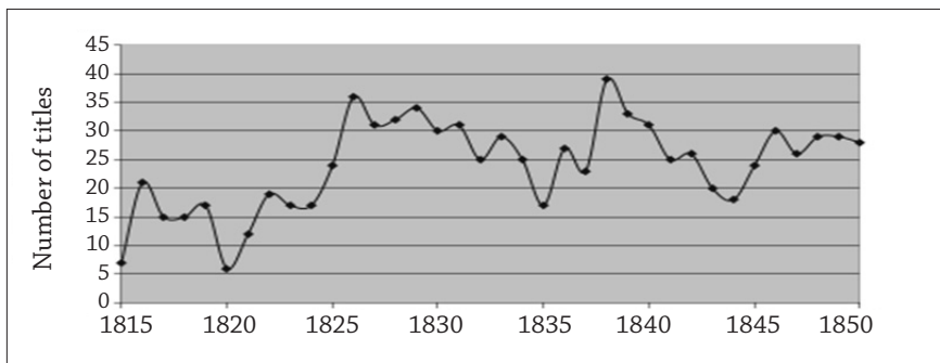
Chart 1. Intensity of book production in Dalmatia (1815–1850)

Although perhaps culturally most developed, with the literary tradition dated back to the age of the Renaissance, Dubrovnik, with its share of 22 percent (198 titles) in the total book production and on average only 5 to 10 titles produced per