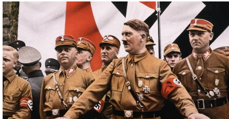
Figure 1. Adolf Hitler (1889-1945) was leader of the National Socialist (Nazi) Party (from 1920-21), chancellor (Kanzler), and Führer of Germany (1933-1945). After President Paul von Hindenburg's death, he assumed the twin titles of Führer and chancellor.