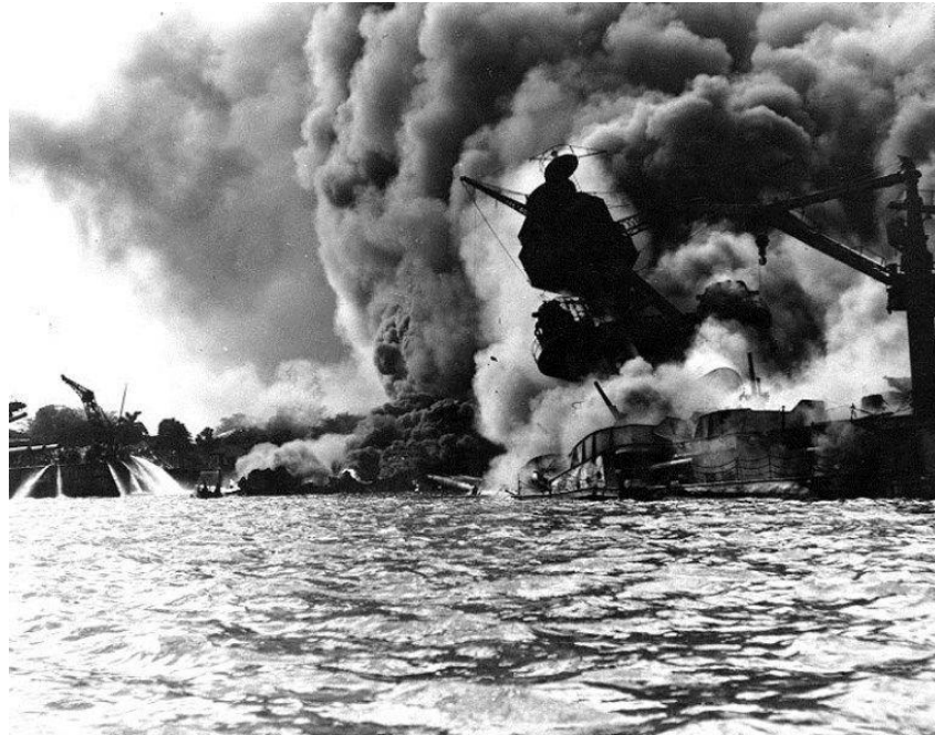
Figure 2. The USS Arizona burns after the attack on Pearl Harbor.

declaration of war. Three days later, the Japanese allies Germany and Italy declared war against the US.