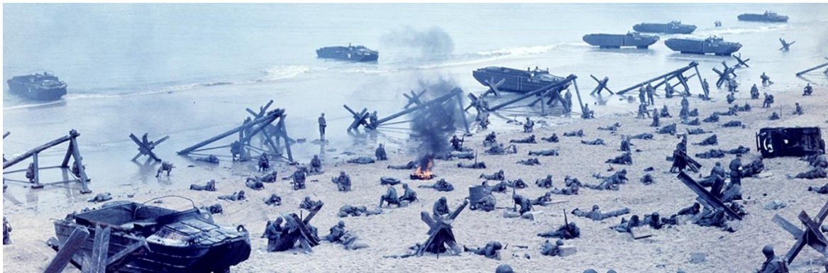
Figure 3. Omaha Beach on D-Day.

The most visceral recreation of the Omaha landing was presented in the movie Saving Private Ryan , which this thesis will analyze in one of the following chapters. There were many attempts to recreate this landing Spielberg's being one of the most truthful ones. By depicting the horror and brutality of war as truthfully as possible, Spielberg wanted to make a movie that veterans could recognize and be moved by (Haggith 178).