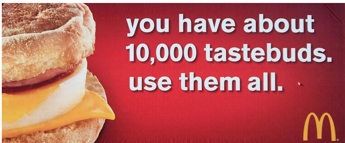
Picture 1: An example of soft sell advertising: McDonald's Egg McMuffin 1

There are different approaches to advertisement, like notions of soft sell and hard sell. A hard sell approach assumes that the consumer needs more information in order to purchase products or services, whereas soft sell approach is used where the impression is more important than the information (Louise 2014). While hard selling makes a direct appeal, soft selling relies more on mood than exhortation, and on the implication that life will be better with the product or service (Christelle 2012). In other words, with hard selling advertisers usually make imperative sentences to make a direct appeal to customers, and with soft selling they “set the mood” for buying a particular product or service, by appealing to customer’s needs, desires or motives. Many times the effect of soft sell is produced just by placing the brand or logo and a new product on the picture of a successful and beautiful woman or a handsome man (if we are trying to sell a perfume, for example). Therefore, there is no need to translate this kind of advertisements, but sometimes the pictures have to be adapted to the target market.