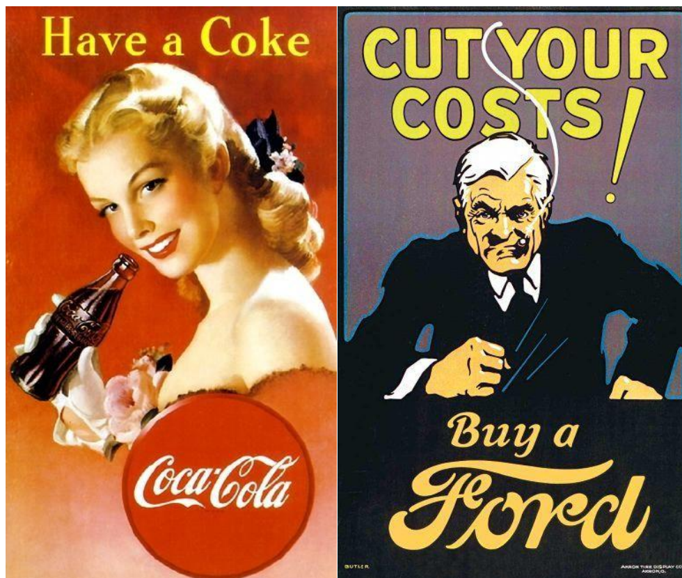
Picture 2: Examples of hard sell advertising: Coca Cola 2 and Ford 3

enjoy its taste more than by eating any other food. Even though this is an example of soft sell, it is visible how influential it can be in many levels. In some cases, it can be more effective than hard sell, because it draws people to try the product or service by appealing to their emotions of pleasure, happiness, comfort, love, etc. Advertisers often choose this way of advertising because it is less direct and the customers do not find it arrogant or bossy as hard sell adverts.