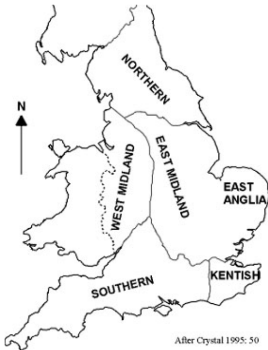
7 Fig. 2 Map of the main Middle English dialects

standardization of spelling. The main Middle English dialects are Northern, East Midland, West Midland, South-Eastern, and South-Western.