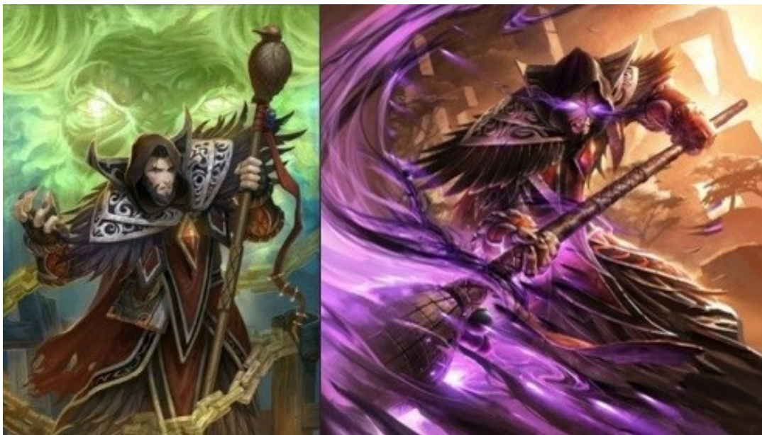
Figure 2. Corrupted Medivh