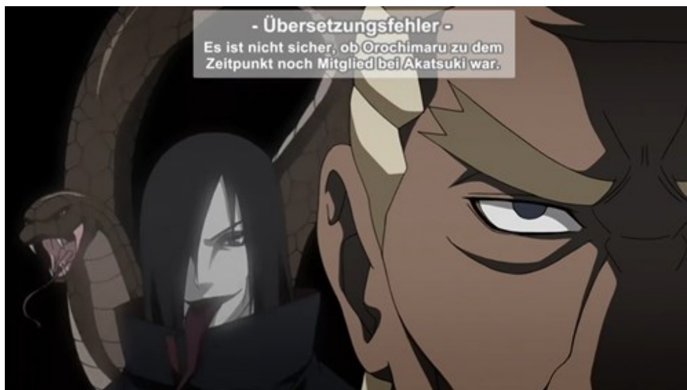
Figure 4 Translation mistake. A pop-up window appears, explaining whether the translation is reliable or not.