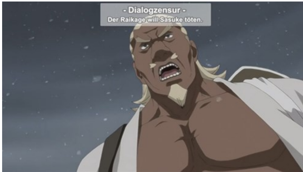
Figure 3 Censoring the dialogue completely can lead the viewers to have different understandings of the plot. To prevent this, a small pop-up window with an explanation appears.

billig sie anzuheuern , which means It may not be cheap to hire them . This leads the audience to believe that the Akatsuki organisation operates differently in the two versions. However, it may also be a false translation, which perhaps was not marked as is the usual practice (see Figure 4).