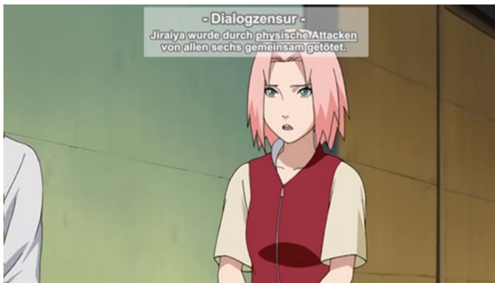
Figure 2 „Dialogzensur“ in the German dub. Words depicting death are censored and replaced with soft words, e.g. kill vs. defeat . © Naruto Shippuden, episode 157.