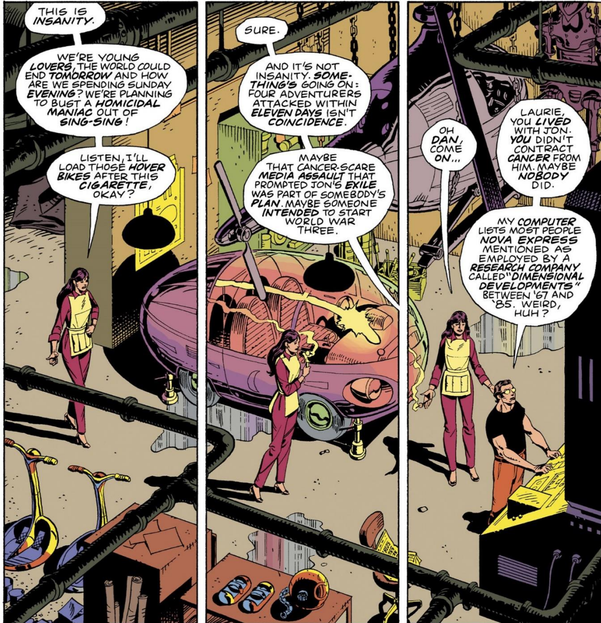
Image 3: Example of how Watchmen utilizes its art to create a cinematic feeling in the reader. A single background image is split into three, while the positioning of characters within the image gives the reader a feeling of motion.