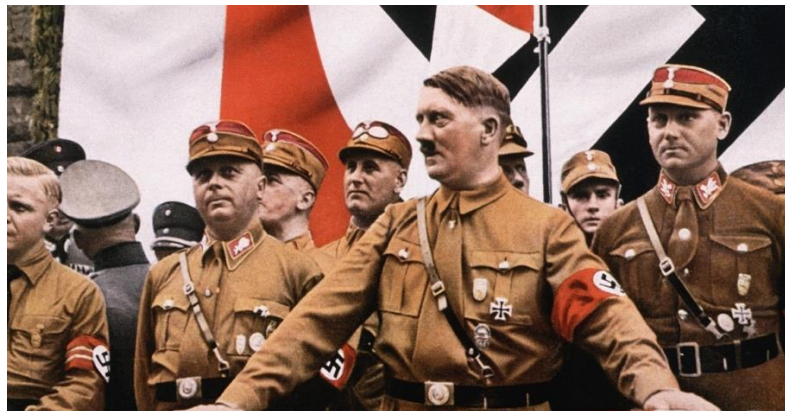
Figure 1. Adolf Hitler (1889-1945) was leader of the National Socialist (Nazi) Party (from 1920-21), chancellor (Kanzler), and Führer of Germany (1933-1945). After President Paul von Hindenburg's death, he assumed the twin titles of Führer and chancellor.