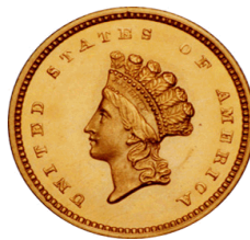
Fig. 4. Indian Princess Gold Dollar, small head—type 2 (1854–1856). The coin spot . http://www.thecoinspot.com/1dg/1854%20GOLD%20DOLLAR%20-%20Type%202,%20Indian%20Princess,%20Small%20Head%20Obv.png . Accessed 23 May 2015.