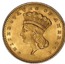
Fig. 5. Indian Princess Gold Dollar, large head—type 3 (1856–1889). The coin spot . http://www.thecoinspot.com/1dg/1856-D%20GOLD%20DOLLAR%20Type%203,%20Indian%20Princess,%20Large%20Head%20Obv.png . Accessed 23 May 2015.

A couple of decades before finding its way to the federal mints, during the 1820s, the noble Indian trope came to life. In tune with the romantic tradition and the national need for cultural independence from Europe, the era of visual celebration of American Indians began. While many painters from the East “produced Indian scenes in their studios,” some of them traveled