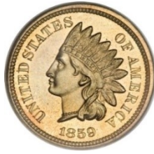
Fig. 1. Indian head cent (1859–1864 / 1864–1909). Numista . http://static-numista.com/catalogue/photos/etats-unis/g1280.jpg . Accessed 23 May 2015.

Advocating its design, the coin's creator, James Barton Longacre, directly related its indigenous accessory to American democratic ideals: