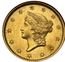
Fig. 3. Liberty Head Gold Dollar—type 1 (1849–1854). The coin spot . http://www.thecoinspot.com/1dg/1849%20ONE%20DOLLAR%20-%20GOLD%20Type%201,%20Liberty%20Head%20Obv.png . Accessed 23 May 2015.

feather bonnet (type 2 and 3 gold dollars), female figures on both the cent and the dollar mints were typically Caucasian, and their indigenous décor was distinctly unrelated to any Native tribe of the time.