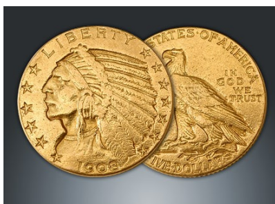
Fig. 7. Half Eagle Indian Head Gold Coin (1908–1929). Northwest territorial mint— numismatic coins . https://bullion.nwtmint.com/rare_halfindians.php . Accessed 23 May 2015.