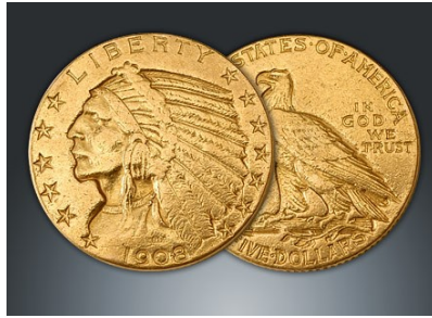
Fig. 7. Half Eagle Indian Head Gold Coin (1908–1929). Northwest territorial mint— numismatic coins . https://bullion.nwtmint.com/rare_halfindians.php . Accessed 23 May 2015.