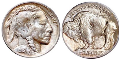
Fig. 8. Buffalo Nickel (1913–1938). USA coin book . http://www.usacoinbook.com/us-coins/buffalo-nickel-mound-type.jpg . Accessed 23 May 2015.