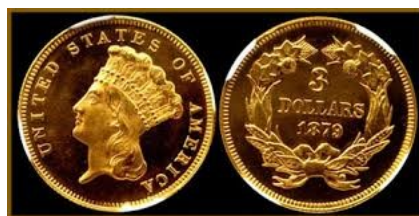
Fig. 2. Three-dollar gold coin (1854–1889). U.S. rare coin investments . http://www.usrarecoininvestments.com/coin_info/three_dollars.htm . Accessed 23 May 2015.