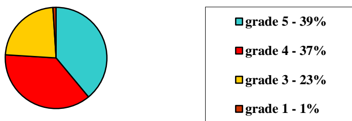
Chart 1: Grades

The learners were at the intermediate level of language proficiency and their L1 was Croatian. Their language learning background was both instructed and naturalistic. In addition, there were two different topics: (1) Some people say that international sports events bring countries closer, while others say that they cause problems between countries and (2) Some people say that there should be limits to what students can wear at school. Others say there should not. Moreover, the production of the language collected in this sample was unplanned.